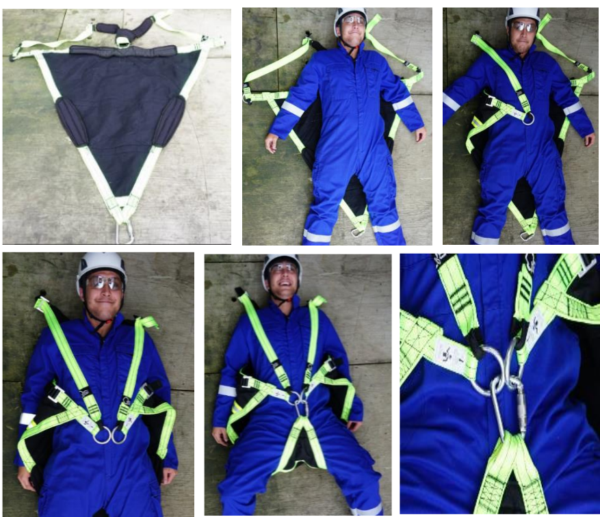
Easy to Place Patient into Harness

*Colors can be customized based on organizational needs