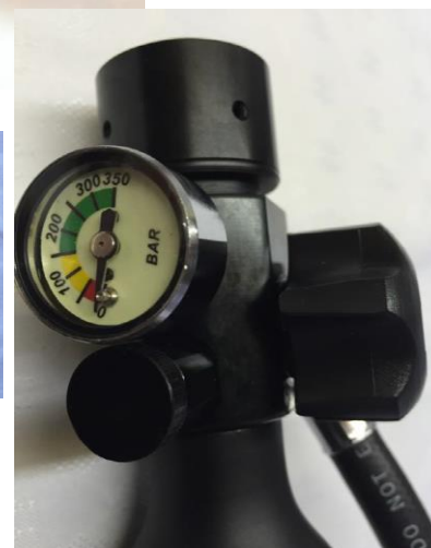
PEEBD1206 Pressure Gauge & Filling Connection