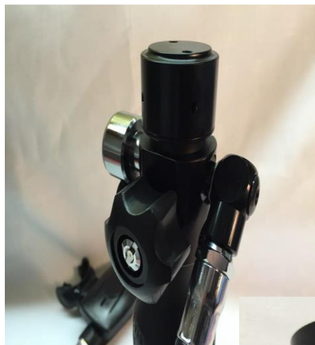
Unique Swivel Hose Connection with “OFF – ON” Control Knob

Other unique features includes a single design 1 st Stage regulator for both the 3,000psi and 4,500psi systems. This feature allows for Users currently locked in to 3,000psi systems at a later date to update the system to 4,500psi without the need to replace the entire system – this feature ensures costs savings to the customer and enhanced life of the product.