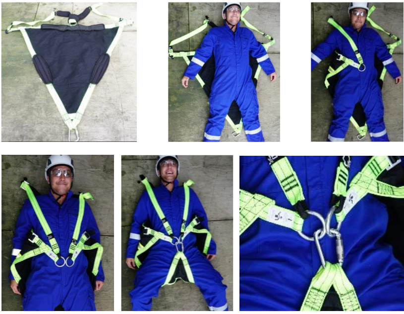
Easy to Place Patient into Harness

*Colors can be customized based on organizational needs