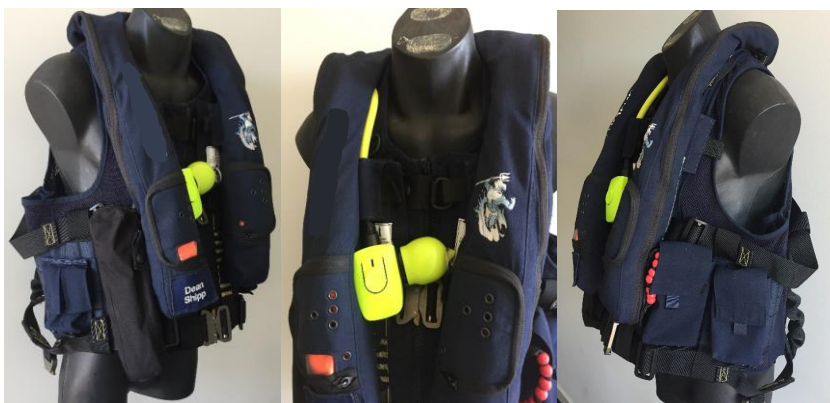
Spare Air Retainers – Left & Right-hand side options – MOLLE adjustable pockets