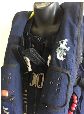
Concealable Lifting Strops