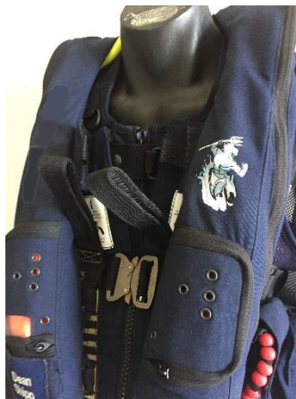
Concealable Lifting Straps