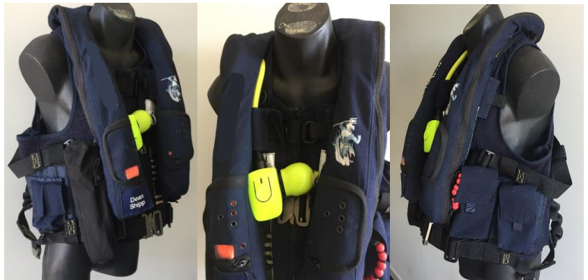
Spare Air Retainers – Left & Right-hand side options – MOLLE adjustable pockets